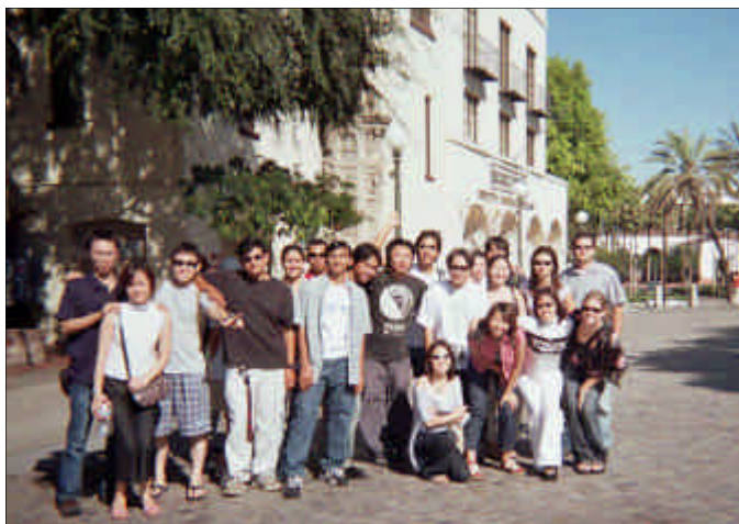
International students and friends take advantage of the ISC sponsored cultural excursion to historic Olvera Street, the first settlement in Los Angeles.