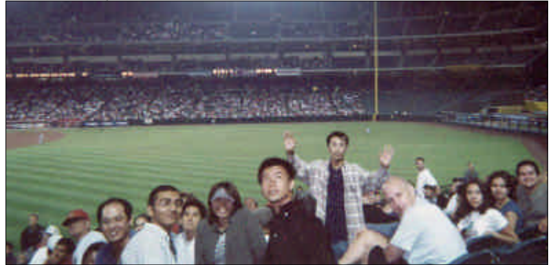
International students turned Angels baseball fans pause for a picture during the 11-inning game

train, the metro, or the bus on our events, I hope students gain a bit of logistical knowledge and feel capable to venture out and see what Southern California has to offer. The ISC hopes to harness the enthusiasm of the orientation